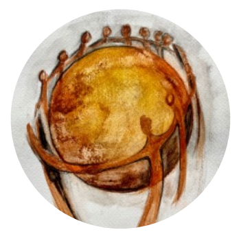
Be one with your true nature